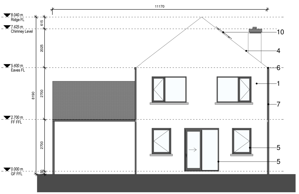
3 06 Rear Elevation 1:100 @ A3